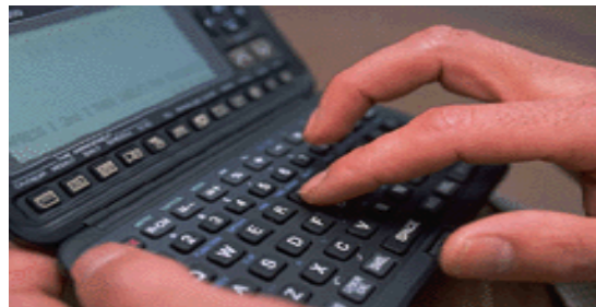
Human Resource Efficiency

In addition to external guest speakers, we also utilize the MSHRM membership as a resource to learn from other employer experiences.